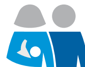
Childcare and eldercare